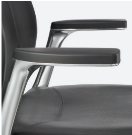
Urethane arm cap

Choose between the less formal urethane arm caps, or the more tailored upholstered arm caps.