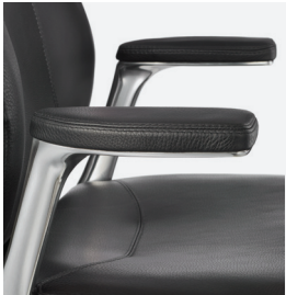
Upholstered arm cap

Adjustable arms that move up and down and pivot are available.